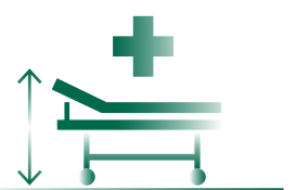
HEALTH CARE SUPPLIES